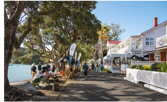
Duke of Marlborough Hotel, Russell, Bay of Islands NZ Millennium Cup Headquarters

Disclaimer: Please note this document is a guide only as regulations are subject to interpretation and change.