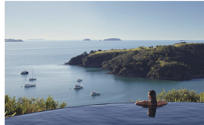
Delamore Lodge, Waiheke Island, Auckland's Hauraki Gulf.